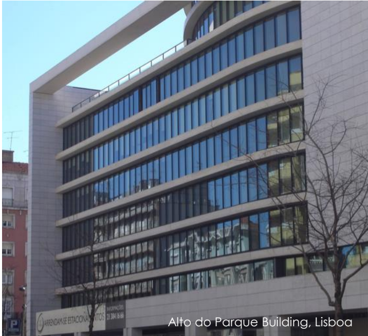
Alto do Parque Building, Lisboa