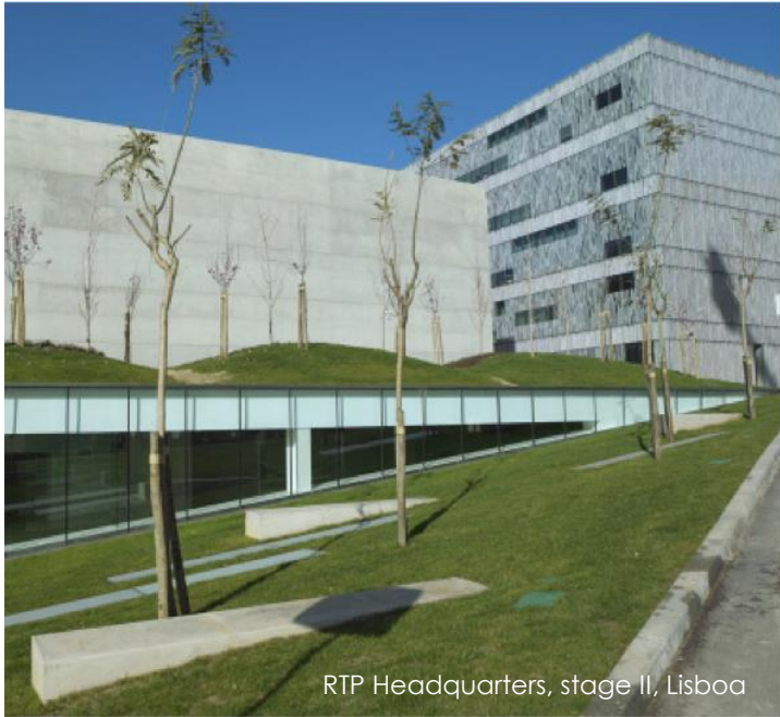
RTP Headquarters, stage II, Lisboa