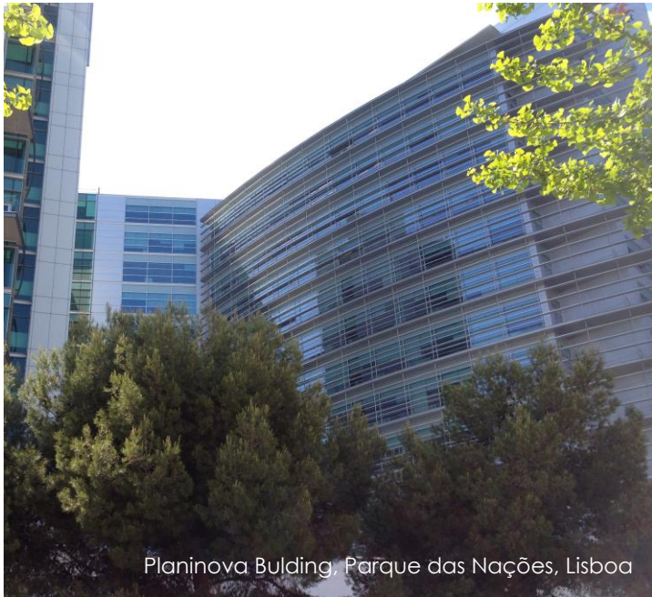
Planinova Building, Parque das Nações, Lisboa