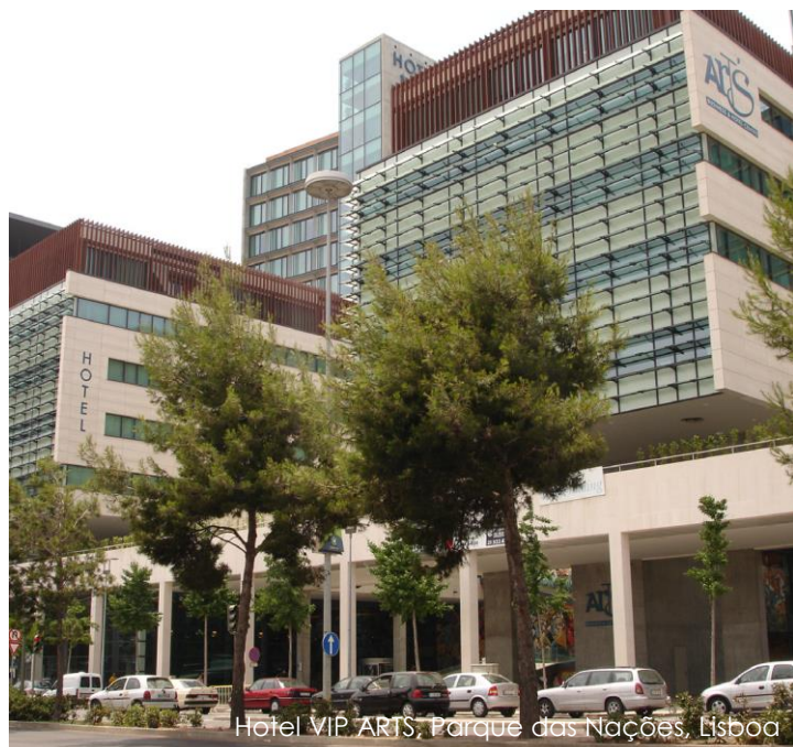
Hotel VIP ARTS, Parque das Nações, Lisboa