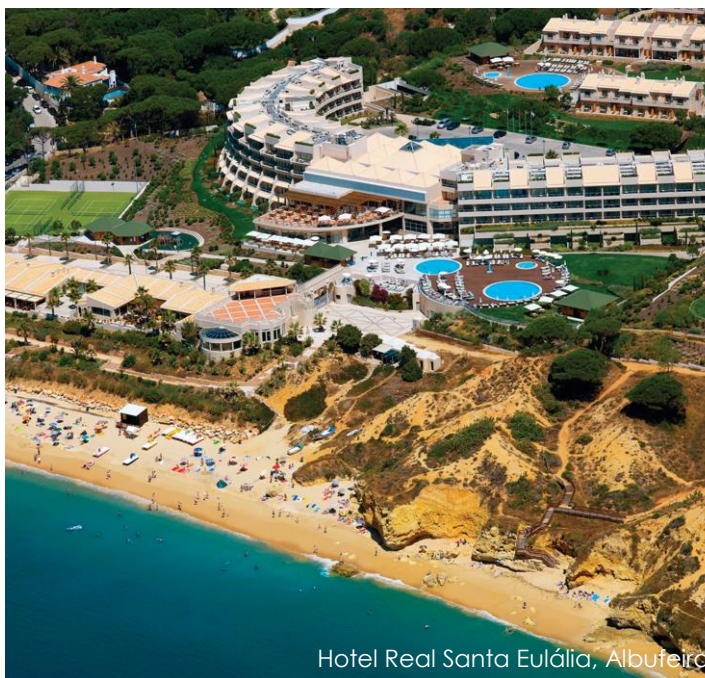
Hotel Real Santa Eulália, Albufeira