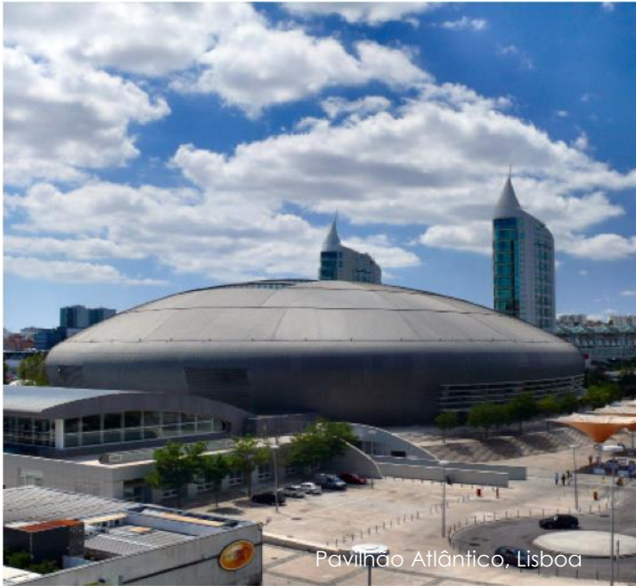
Pavilhão Atlântico, Lisboa