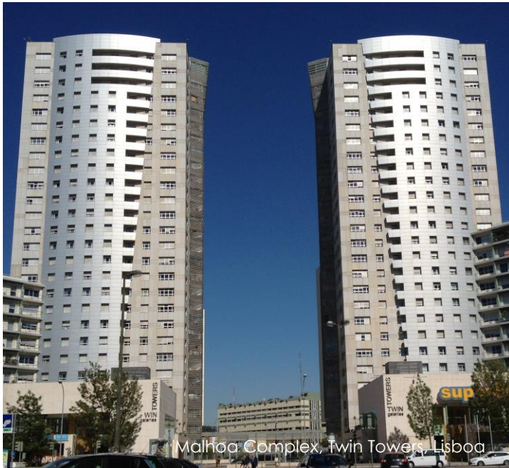
Malhoa Complex, Twin Towers, Lisboa