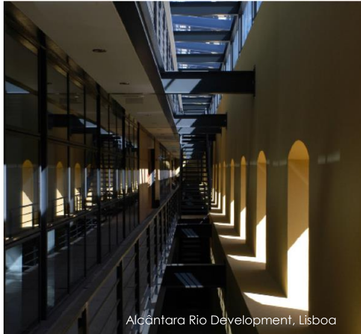
Alcântara Rio Development, Lisboa

General Infrastructures and Allotments; Basic Sanitation; Marinas and Harbors; Residential Buildings; Office Buildings; Hospitals; Hotels; Banks and Bank Offices; Shopping Centers; Schools and Public Buildings; Sports Facilities; Other Projects; Sustainability.