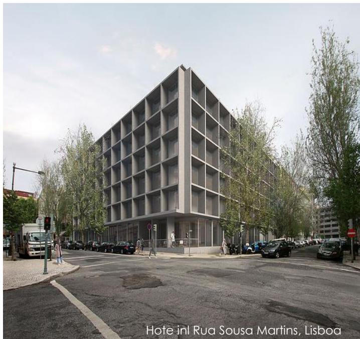
Hotel in Rua Sousa Martins, Lisboa