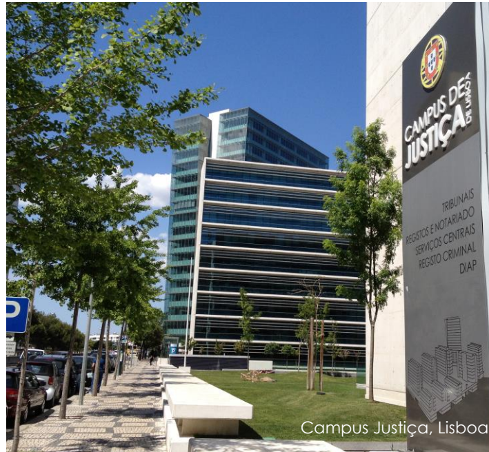
Campus Justiça, Lisboa