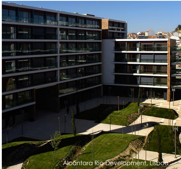
Alcântara Rio Development, Lisboa