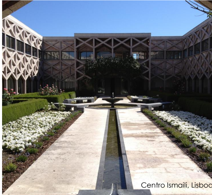
Centro Ismaili, Lisboa