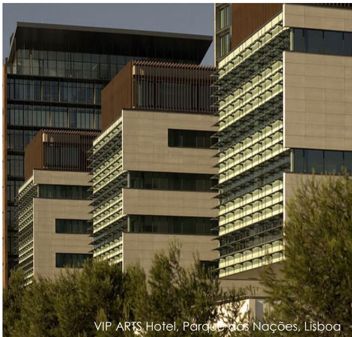
VIP ARTS Hotel, Parque das Nações, Lisboa